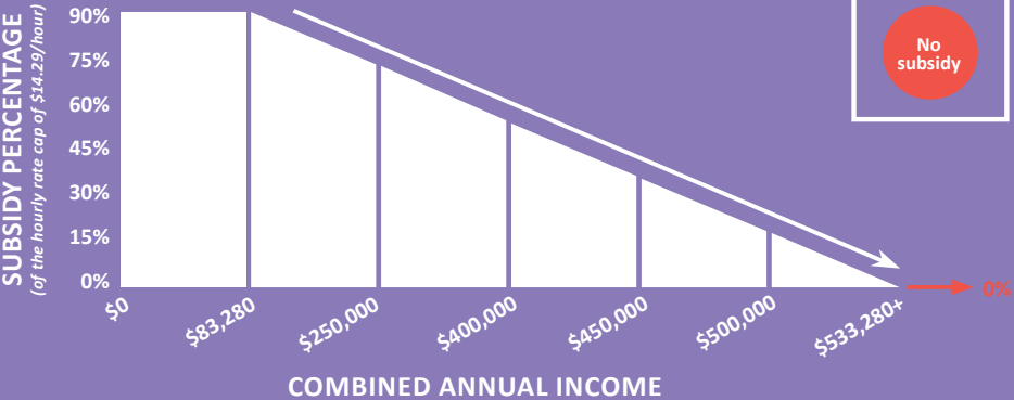
Subsidy by combined annual income